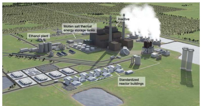
Figure 4. Rendering of a repowered 1,200 MWe, two-steam-unit plant 25