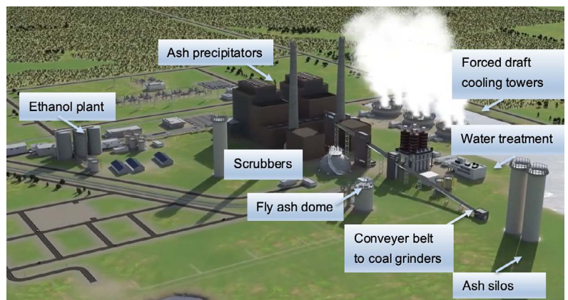
Figure 3. Rendering of an existing coal plant

The study also shows the feasibility of retaining much of the equipment on site, which would save about one-third of the cost of a new nuclear plant, a 30-35% reduction in total plant CAPEX, and reduce construction time substantially. Furthermore, 60-70% of the local workforce could be retained. Figure 3 pictures an existing coal-fired power plant while Figure 4 shows the proposed repurposed plant with nuclear energy—retaining large parts of the existing infrastructure. (Please refer to Figure 3 which identifies the components of the existing coal power plant.)